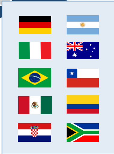
Medical cannabis legalized post-2014